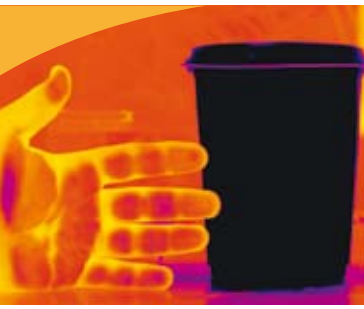
Thermal imaging: cold cup