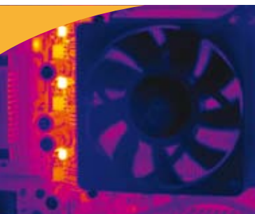
Thermal imaging: electronics circuit